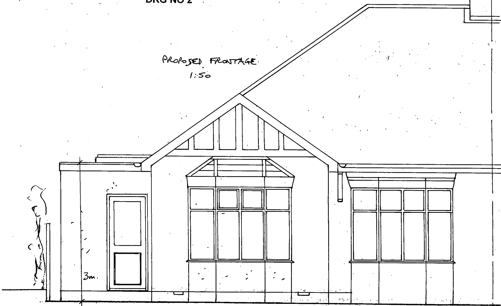
PROPOSED FRONTAGE 1:50

PLAIN TILED BAY. RENDER/FACING BRICK TO MATCH EXISTING AS CLOSELY AS POSSIBLE. DARK GREY OR BLACK FASCIA/ DOOR/WINDOW FRAMING TO BE AGREED.